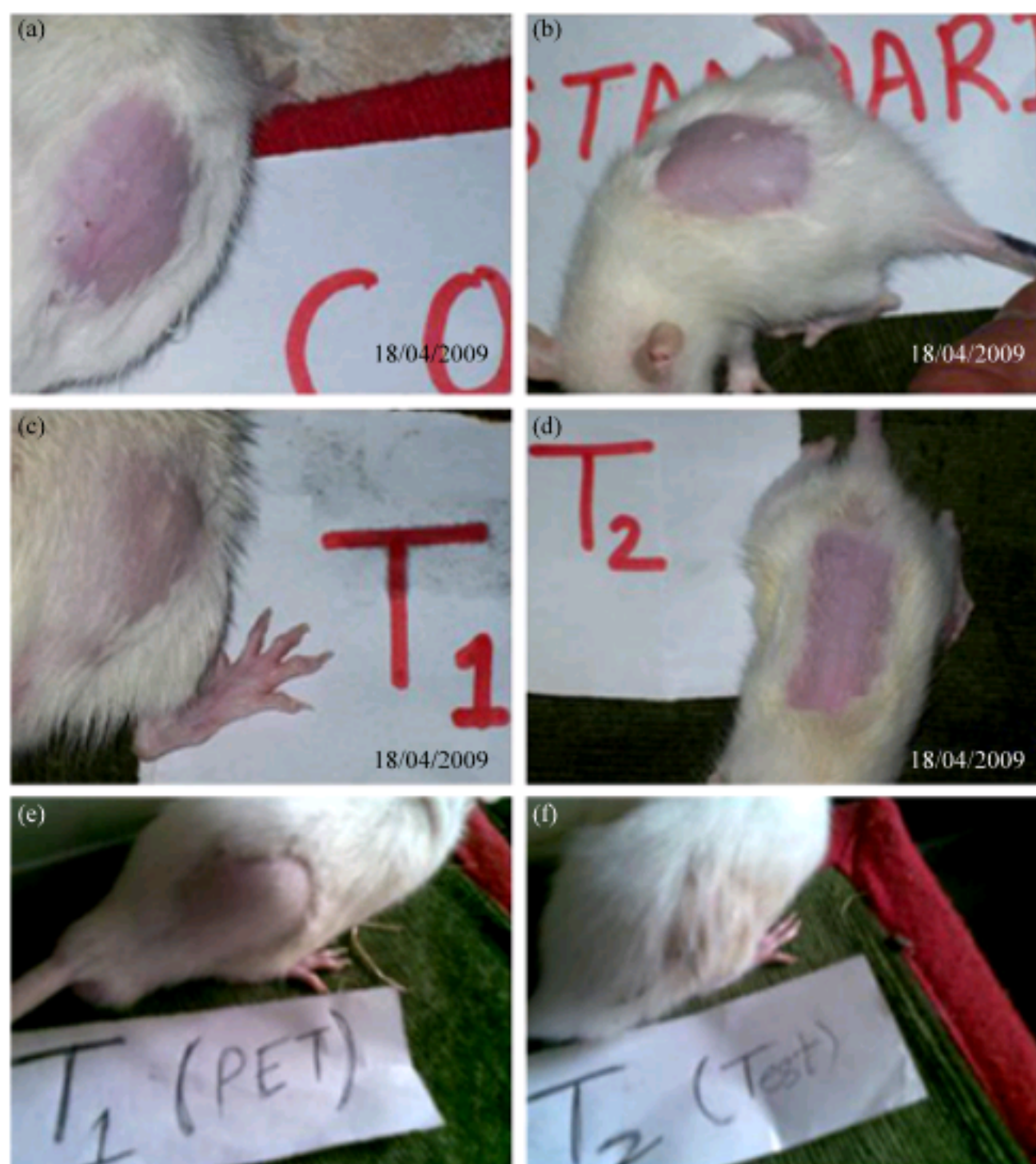
Fig. 2: In vivo hair growth study showing hair growth initiation day photographs of rats treated with formulation prepared from ethanolic extract and petroleum ether extract of Trigonella (a) Control (6th day), (b) Standard (6th day), (c) T 12 (6th day), (d) T 21 (6th day), (e) T 1 (5th day) and (f) T 2 (6th day)